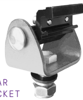
SLIDING BAR LIGHT BRACKET

Fully adjustable sliding bracket system offers greater versatility and flexibility for mounting our bar lights